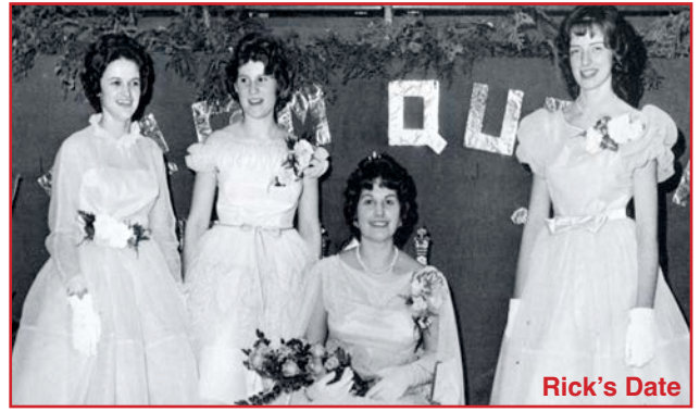
Hardwick Academy, Queen's Court, 1962 Junior Prom